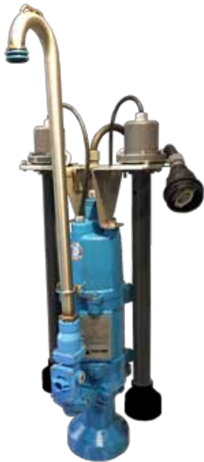
“KER-PC” SHOWN WITH PRESSURE SWITCHES

“EQD” (2000 Series) -OR- “EQD” (Extreme Series)