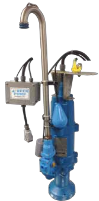
“KER-PC” SHOWN WITH FLOAT SWITCHES